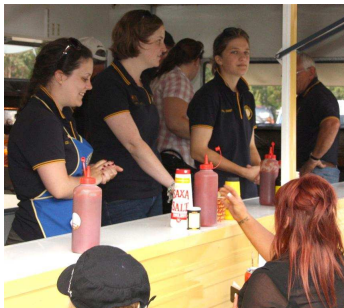
Central Coast Rotaractors manning a food van at the Ulverstone Rodeo