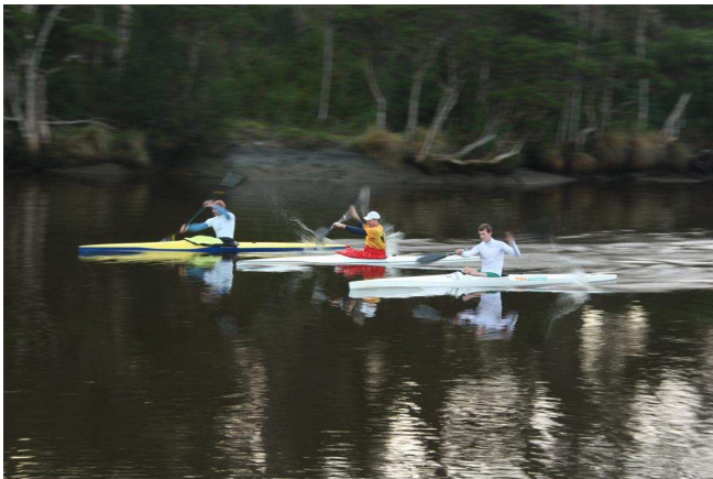
Kayakers paddling past the Cape Bridge Reserve at Wynyard

It's a facility other towns can only dream about - Cape Bridge Reserve is a stone's throw away from the main street in Wynyard. A great place for enjoying the placid river views, bird watching, photography, safe waters for boating and aquatic activities, and walking tracks. Nine different orchids can be discovered along the walking track. Not to forget that most popular of recreational activities - fishing. From the reserve, you can catch a salmon or trout virtually in the main street of Wynyard.