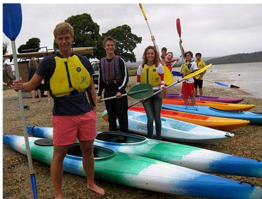
Ready to take to the water at the youth exchange camp